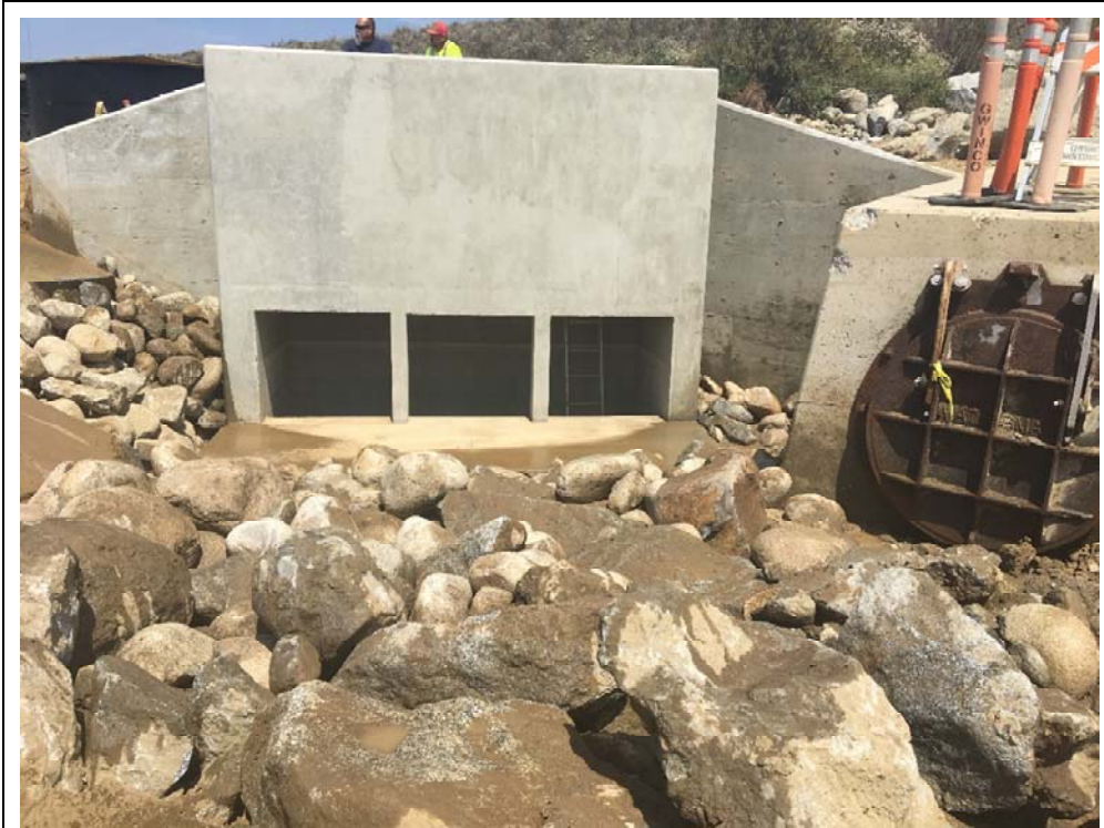
Storm water inlet structure