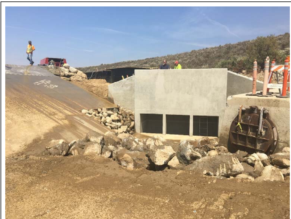
Storm water inlet structure additional view